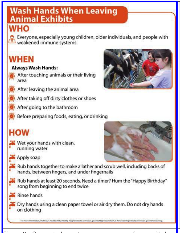
Figure 2 Suggested eight to ensuring compliance with handwashing procedures as a means of reducing the possible spread of infectious disease. Available in several languages at: www.cdc. gov/healthypets/resources/posters.htm. Accessed Sep 27, 2013.

Recommendations for cleaning and disinfection should be tailored to the specific situation. All surfaces should be cleaned thoroughly to remove organic matter before disinfection. A 1:32 dilution of household bleach (eg, 1/2 cup of bleach for each gallon of water) is needed for basic disinfection. Quaternary ammonium compounds also can be used in accordance with the manufacturer label. For disinfection when a particular organism has been identified, additional guidance is available at the Iowa State University Center for Food Security and Public Health website (www.cfsph.iastate.edu/disinfection/). Most compounds require > 10 minutes of contact time with a contaminated surface to achieve the desired result.