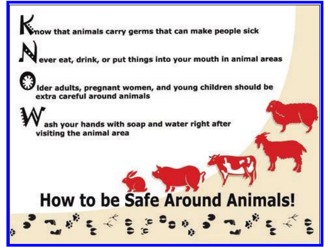
Figure 1—Suggested sign or handout for use in safety education of visitors entering animal areas of petting zoos or other exhibits. Available at: www.nasphv.org/documentsCompendiaAnimals. html. Accessed Sep 10, 2013.

Previous outbreak investigations have revealed that temporary exhibits are often not designed appropriately. Common problems include inadequate barriers, floors and other surfaces that are difficult to keep clean and to disinfect, insufficient plumbing, lack of signs regarding risk and prevention measures, and inadequate handwashing facilities. <sup>20,21,28,52</sup> Specific guidelines might be necessary for certain settings, such as schools (Appendix 3).