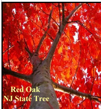
Red Oak NJ State Tree

NJ Soil Conservation Districts (SCD) are special purpose subdivisions of the State. In cooperation with the State Soil Conservation Committee, they are empowered to conserve and manage soil and water resources and address stormwater, soil erosion and sedimentation problems that result from land disturbance activities. There are 15 Soil Conservation Districts in New Jersey. (See back page for list.)