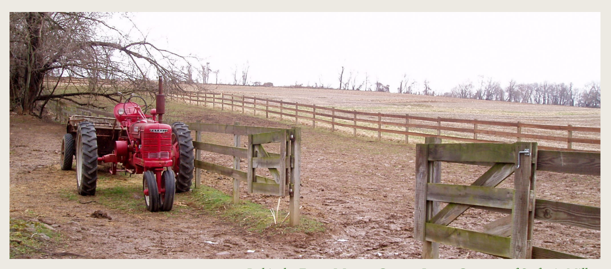
Babinsky Farm, Warren County.