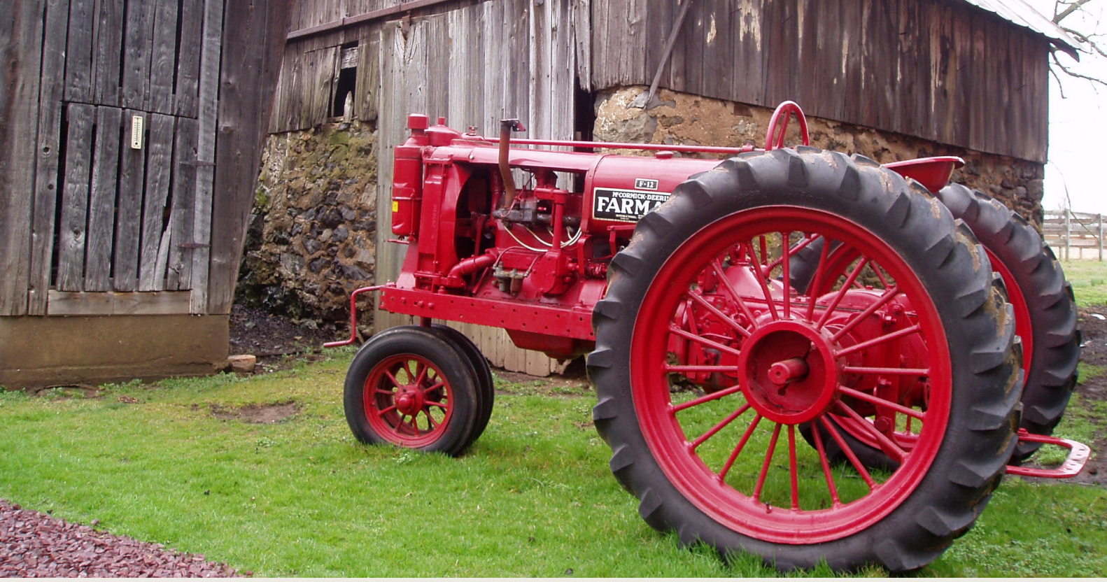
Babinsky Farm, Warren County.