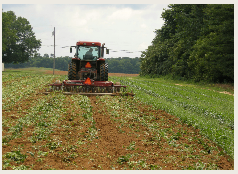
Cairone Farm, Gloucester County.