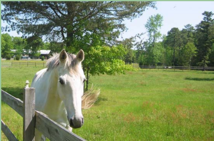
Allen Farm, Deerfield, Cumberland County