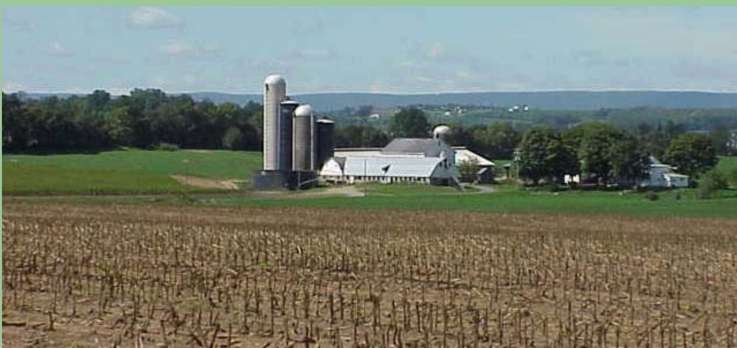
Heeres Farm, Harmony Township, Warren County