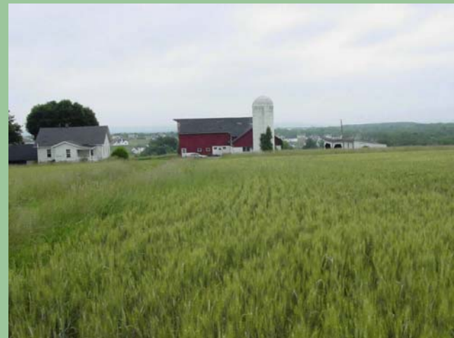
Cavalier Farm, East Amwell, Hunterdon Co.