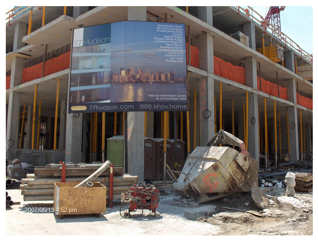
The construction site at 77 Hudson Street, a high-rise residential development in Jersey City. The complex will have two towers and 901 condominiums.

There were bright stars in 2007 that softened the effects of the housing slump. New Jersey's cities have been among the top performers in recent years and this trend continued in 2007. Jersey City in Hudson County stands out with the most construction. The estimated cost of work authorized by permits was $994 million. The City's housing market stayed strong. New home construction accounted for about 68 cents of every dollar authorized by the construction office in 2007. Jersey City had 2,895 authorized housing units, more than any other locality. This municipality accounted for over 11 percent of all new dwellings in the State. One of the bigger permits in 2007 was for a twin-tower residential complex being built by K. Hovnanian. It will have 901 condominiums.