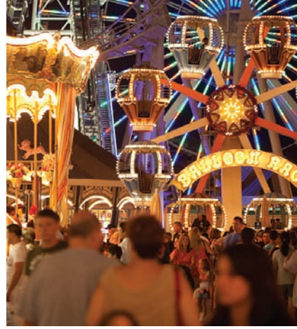
25th Avenue Amusement Pier, Wildwood

New Jersey Historic Preservation Office and New Jersey Department of Community Affairs. Grant and technical assistance requests to these agencies always exceed available resources.