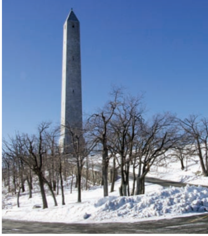
High Point Monument, High Point State Park

with the New Jersey Department of Transportation to support the adoption and implementation of the plan and will encourage historic sites to participate.