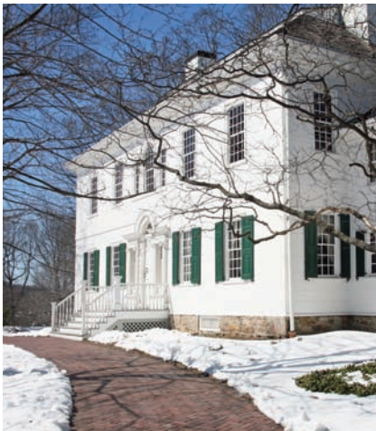
Ford Mansion, Morristown National Historical Park, Morristown

Morris County's Destination Marketing Organization uses limited financial resources strategically to promote the area's history. The plan showcases four National Historic Landmarks to show trends in the nation's development and to connect the sites to current issues. The DMO has reached visitors through national magazines like Preservation and American Heritage . Morristown was named one of the National Trust