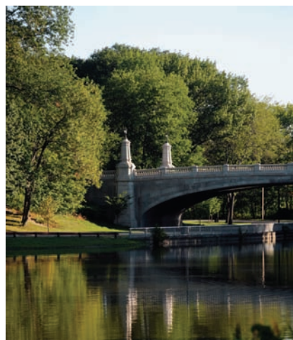
Essex County Branch Brook Park, Newark