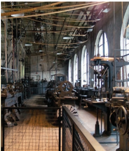
Thomas Edison National Historical Park, West Orange (U.S. Department of the Interior, National Park Service, Thomas Edison National Historical Park)

The Edison National Historical Park offers an opportunity for heritage travelers to see the factory where Thomas Edison worked for 44 years, developing more than half of his 1,093 patents for his inventions. Several factory floors with new exhibits were opened to the public for the first time in October 2009 after a 6-year, $13 million restoration effort. Between opening day October 9, 2009 and January 3, 2010, close to 16,000 visitors toured the laboratory complex; 6,000 also visited Edison’s home, Glenmont.