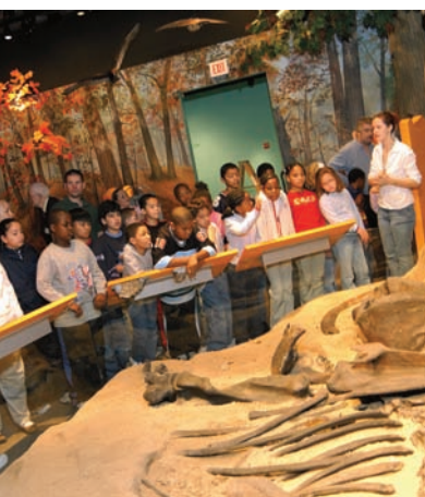
Newark Museum, Newark

merchandise), enhanced interpretation at parks and recreation areas, creation of inventories and evaluation of the impact of heritage tourism.