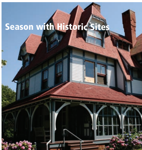
Emlen Physick Estate, Cape May

In Cape May , heritage tourism has successfully expanded the traditional 12-week beach resort tourist season. Almost 300,000 visitors a year tour the town's three restored historic sites (the 1879 Emlen Physick Estate, the 1859 Cape May Lighthouse and the World War II Lookout Tower), take an array of community history tours (on five trolley buses, by boat and walking through historic interiors) and participate in a year-round schedule of special events.