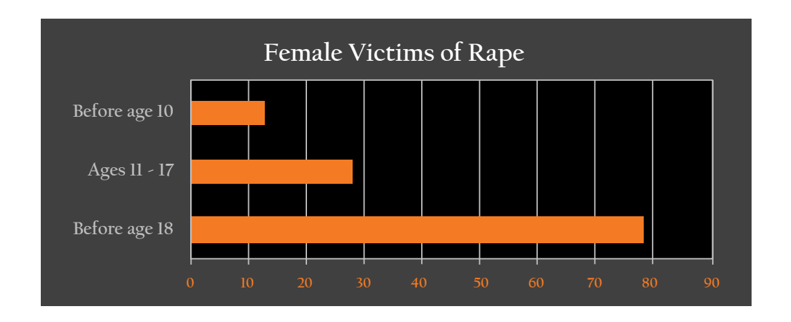
Figure 1. Age of Female Victims of Rape (Breiding et al., 2010).

Another aspect of TDV is sexual violence. According to NISVS most female victims of a completed rape (78.7) experienced their first rape before the age of 25 with (40.4) experiencing their first rape before age 18 (28.3%) between 11-17 and 12.1% at or before the age of 10) (Breiding, Smith, Basile, Walters, Chen & Merrick 2010).