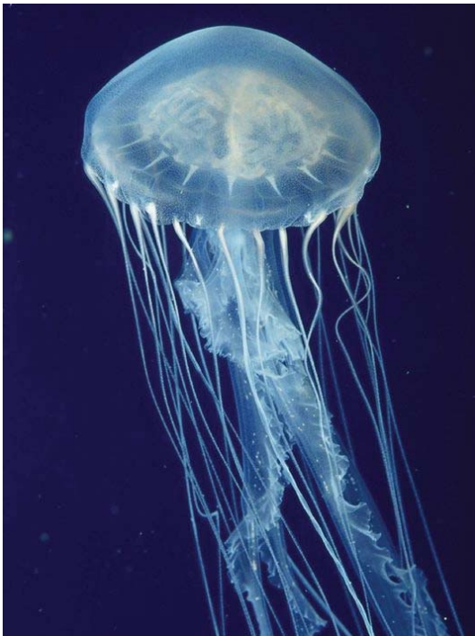
Stinging Sea Nettles