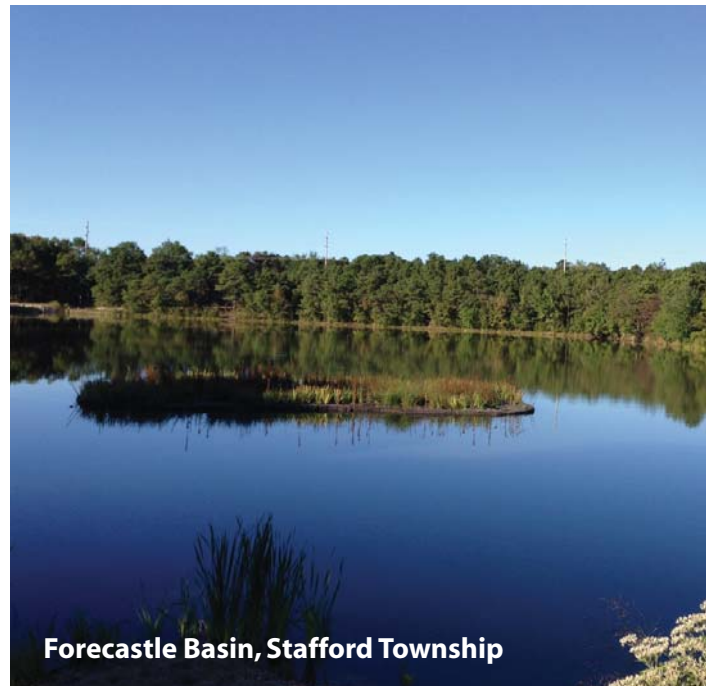
Forecastle Basin, Stafford Township

Much of the deterioration of the Bay can be traced to pollutants that runoff from lawns and streets. Through this Action Item, NJDEP established funding for capital improvement projects and equipment designed to remove pollutants that adversely impact Barnegat Bay. Our focus has been and continues to be on green infrastructure projects, such as gravel wetlands, porous pavements and rain gardens that can help reduce stormwater runoff and treat the runoff that makes it to the Bay.