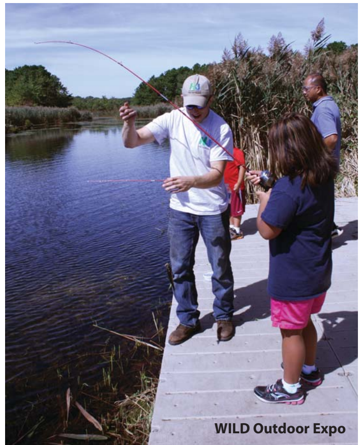
WILD Outdoor Expo