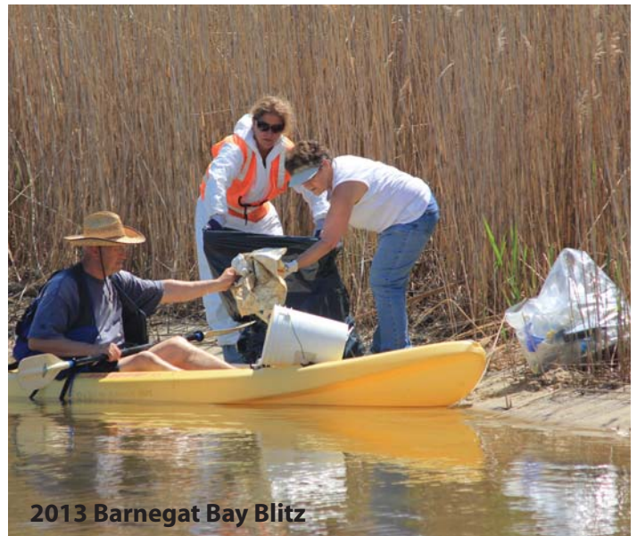
2013 Barnegat Bay Blitz

Changing the daily actions of residents and visitors in the Barnegat Bay watershed can have significant positive impacts on the bay and local environment; such actions include how people landscape their homes, maintain their yards, use water and operate their boats. These actions can impact the Bay's water quality and ecology and in turn, can affect the economy and tourism. Education and stewardship activities offered by DEP (with several partners) include interpretive programs, trail walks, cleanups, competitions, school seminars, curricula, public events, volunteer monitoring, website and listserv communications, and media announcements. These offerings target all ages and audiences and are designed to engage people in hands-on science-based learning about the Bay.