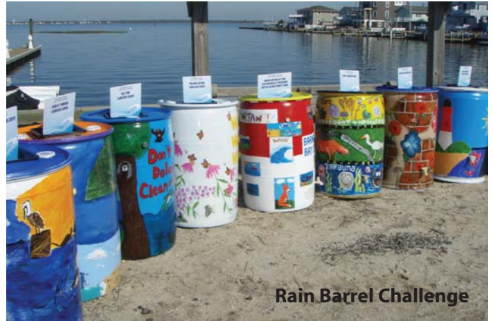
Rain Barrel Challenge