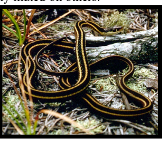
Eastern Ribbon Snake

-Single light-colored stripe extending from head to tail; often a checkered-board pattern is visible, prominent on some individuals and slightly muted on others