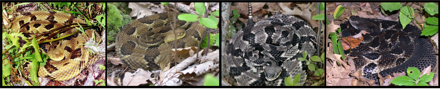
Examples of "yellow" or "light" phase