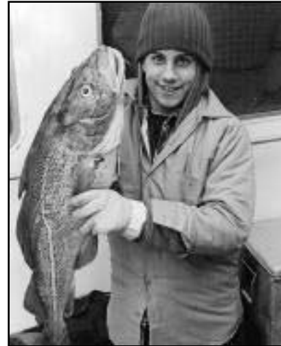
Codfish are taken in cold, deep waters.

Captain Carlson , Charter, 30' Capt. Rick Herishen, 104 East Wisteria Road, Wildwood Crest, NJ 08260 D: 609-522-0177 June - September; Half-Day, Full-Day Fluke, Weakfish, Wreck/Reef, Shark, Bluefish