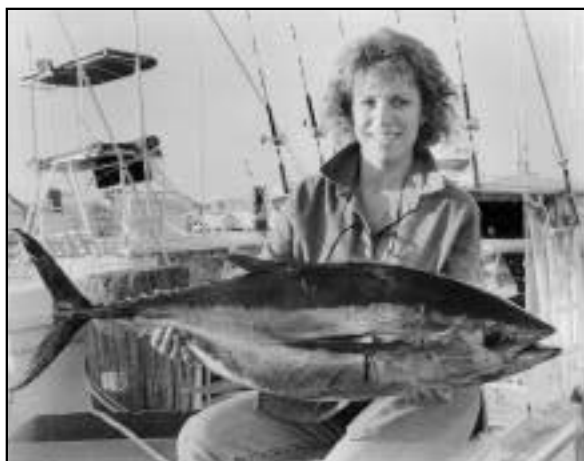
Tuna are caught in offshore, blue waters.