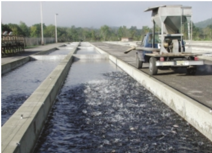
Pequest Trout Hatchery staff feeding trout, an event that takes place a minimum of four times per day.

The year 2001–2002 was another exceptional production cycle for trout at the Pequest State Trout Hatchery. A total of 738,179 brook, brown, and rainbow trout were distributed throughout the state during the spring, fall, and winter stocking seasons. Since 1984 the Pequest rearing facility has exceeded its production goals for producing and stocking quality trout in the waters of New Jersey. The following are production numbers and sizes of trout for 2002.