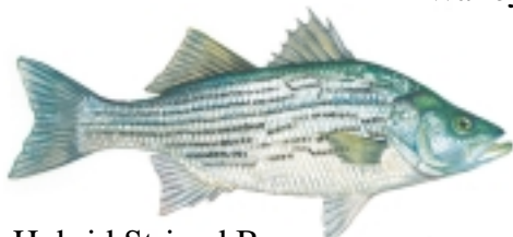
Hybrid Striped Bass