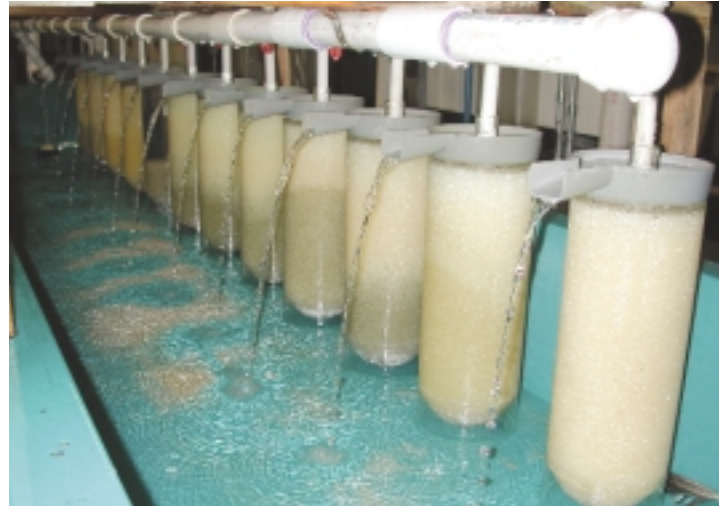
5 million walleye eggs from Swartswood Lake incubating in hatching jars.

* Estimated numbers: these fish were not yet released at press time.