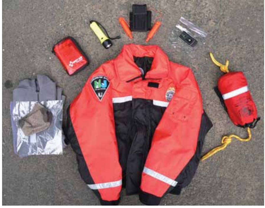
Coldwater Emergency Kit (clockwise from left): Extra clothes in a watertight bag, first aid kit, strobe/beacon, ice awls, cell phone in a watertight bag, throw bag and PFD/float coat (center).

A water-related accident can happen at any time, so be prepared, especially around cold water. By taking a preventative approach, having the proper equipment and identifying winter's dangers, you can enjoy a safe and rewarding outdoor winter experience. \P