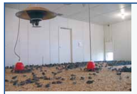
After hatching, chicks stay in temperaturecontrolled brooder rooms equipped with automated feeders until six weeks of age, when they are moved to outdoor range pens.

All persons in possession of a rifle (including a muzzleloading rifle) while hunting woodchuck must have a current and valid rifle permit in addition to the current hunting license. Rifle hunting (of any kind) for woodchuck is prohibited on state wildlife management areas, state parks, state forests or state recreation areas. Farmers and their agents may use shot not larger than #4 buckshot to control woodchuck causing damage. Hours of hunting are sunrise to ½ hour after sunset. See chart at right for woodchuck hunting details.