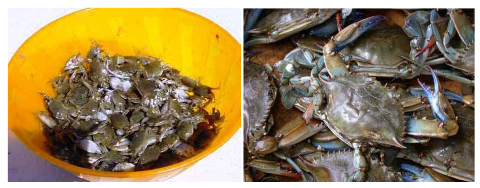
Juvenile Blue Crab