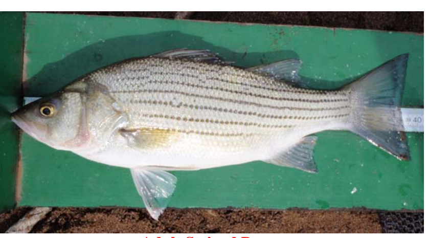
Young-of-Year Striped Bass