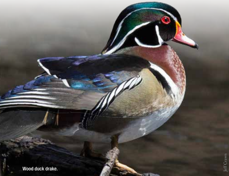
Wood duck drake.