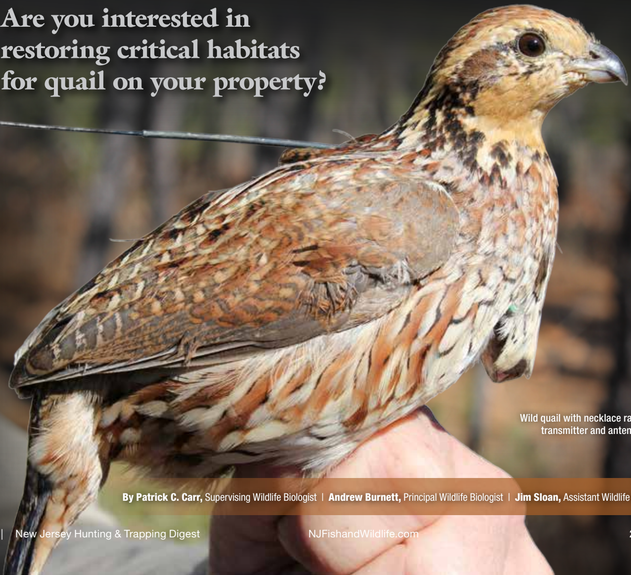
Wild quail with necklace radio transmitter and antenna.

Are you interested in restoring critical habitats for quail on your property?