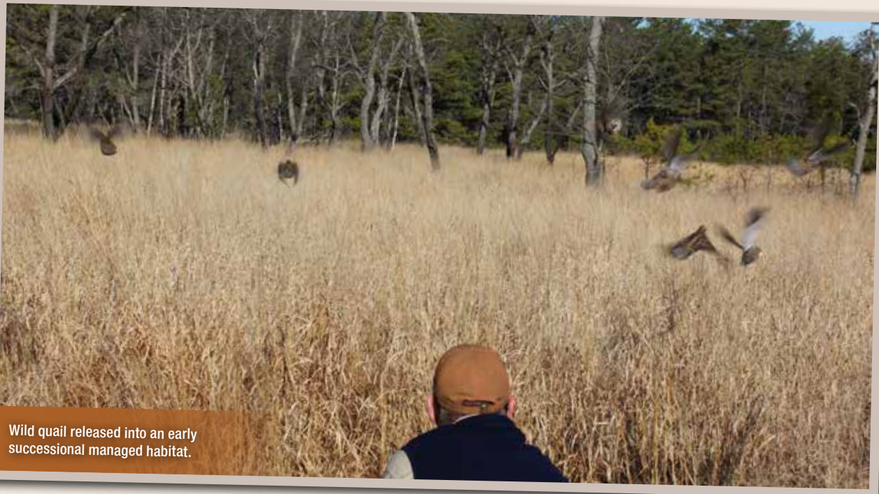
Wild quail released into an early successional managed habitat.