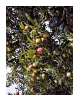
Pick Up Fruit that Falls from Fruit or Nut Trees