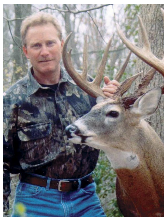
All-time leader for Typical Shotgun Deer (175 7/8) taken in 2004.