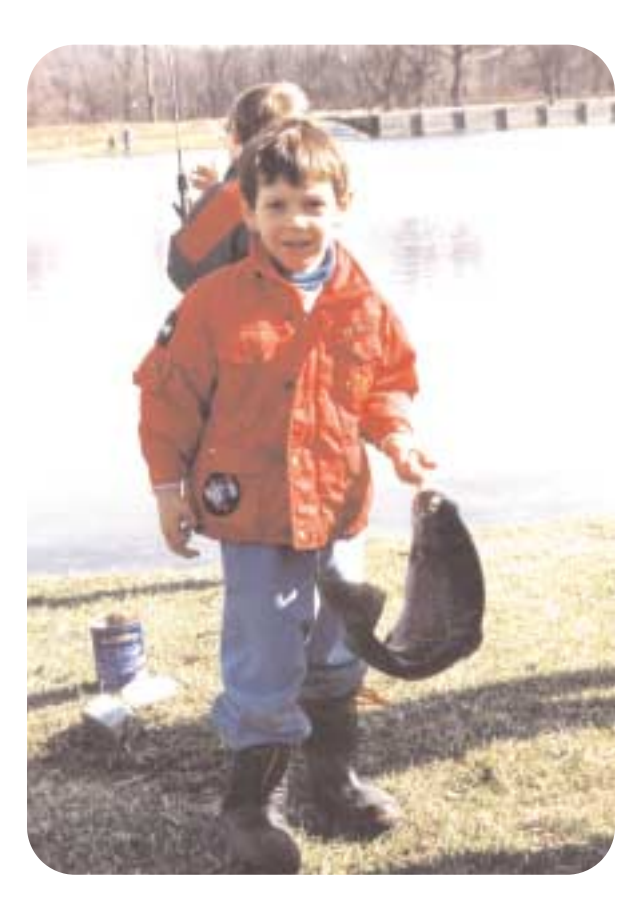
State of New Jersey Department of Environmental Protection Division of Fish and Wildlife