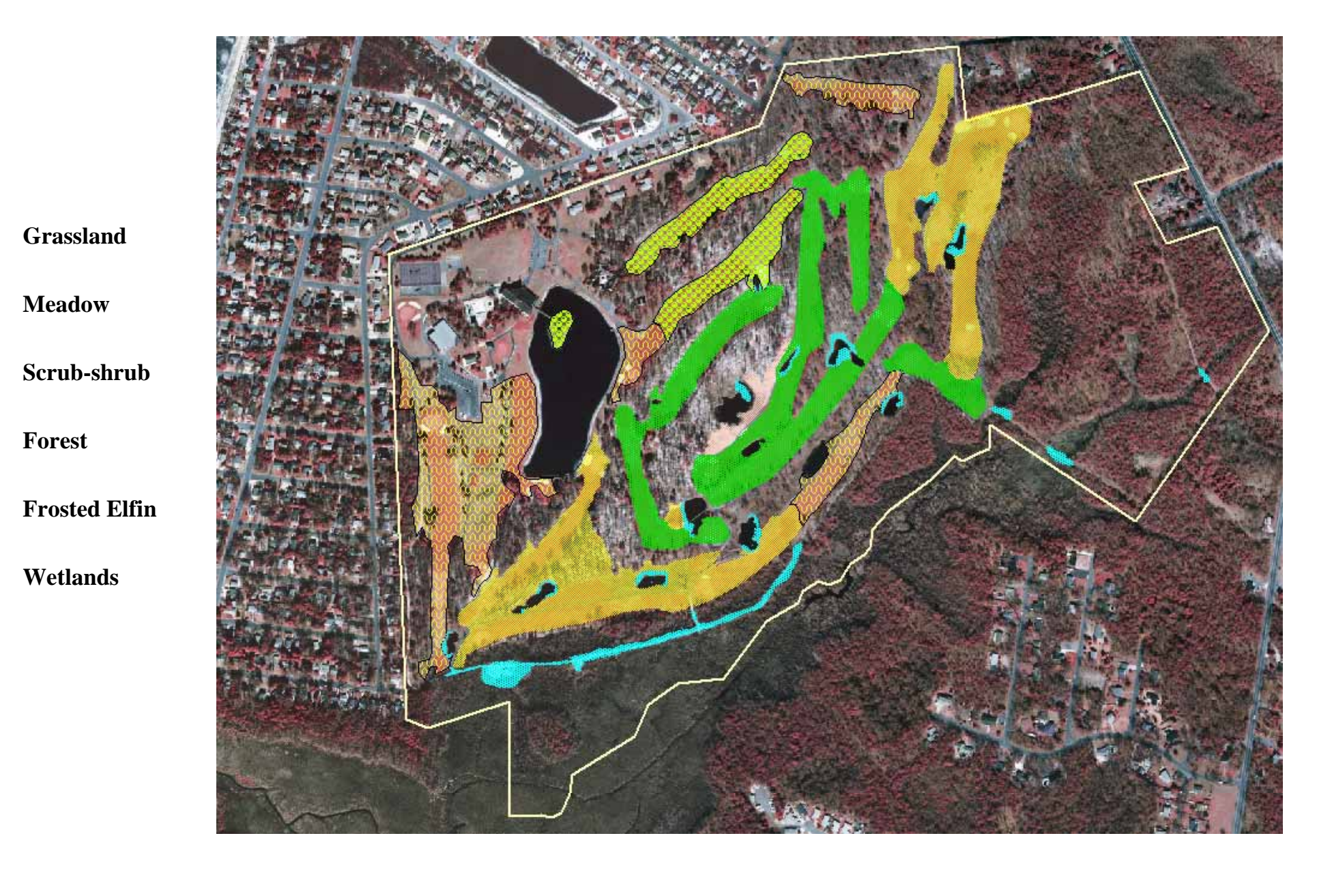
Fig. 2. Proposed habitat restoration within the existing golf course structure of the Ponderlodge. Direct restoration of the following habitat types will be carried out as part of this plan: forest (17.9 acres), forested elfin habitat(1.0 acre), grassland (22.4 acres), meadow (16.4 acres), scrub-shurb (6.4 acres), and wetlands (3.3 acres).