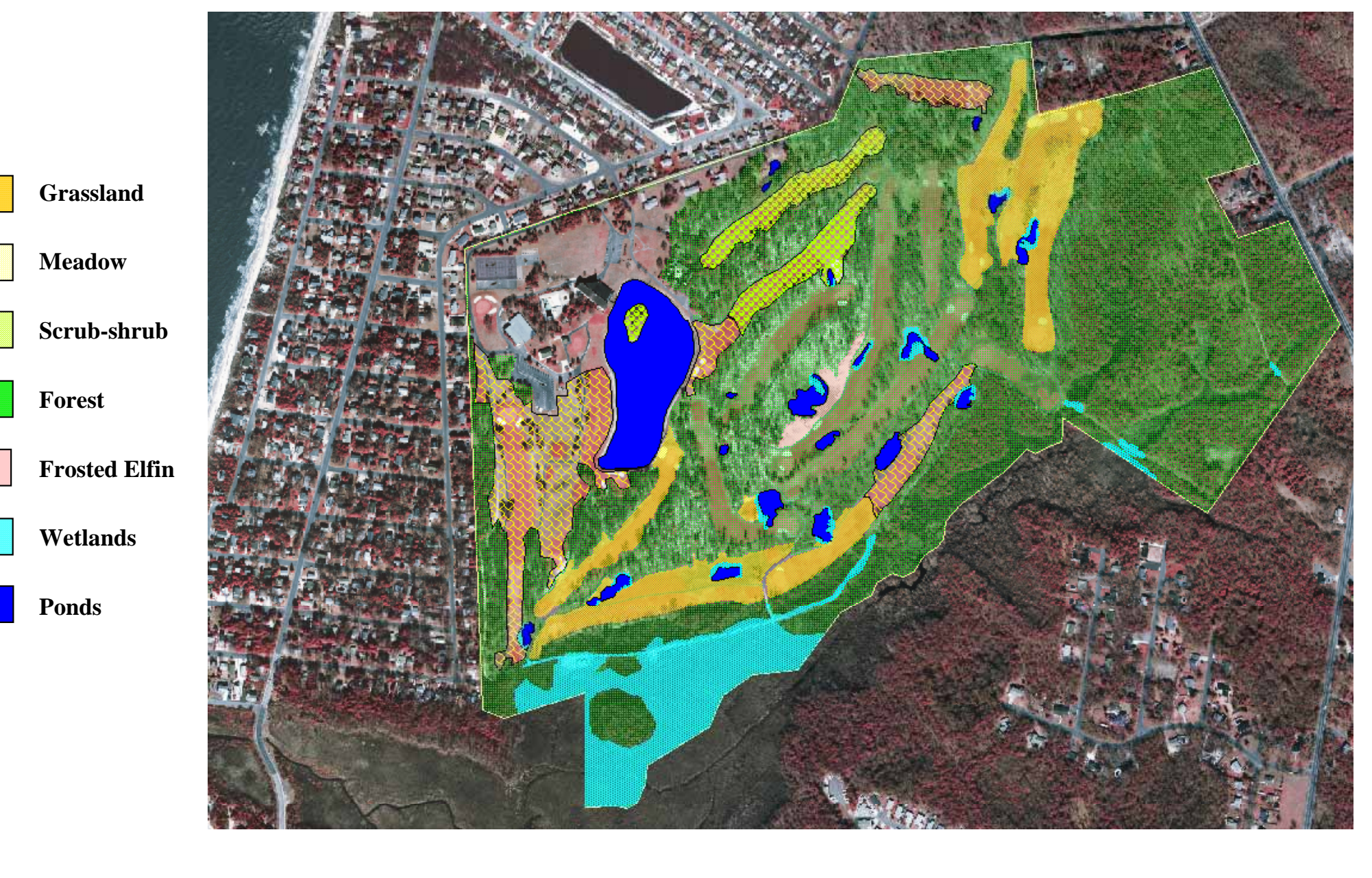
Fig 3. Conceptual map showing the final habitat configuration following the proposed restoration activities at the Ponderlodge. Final habitat acreages are as follows: forest - 140 acres, forested elfin habitat - 1.0 acre, grassland - 22.4 acres, meadow - 16.4 acres), scrubshurb - 6.4 acres, wetlands - 14.4 acres, and ponds - 9.6.