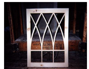
Wood Window Repair Workshop

Phone (home) _____ Phone (work) _____ Email _____