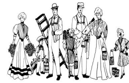
Proud Neighbors of Collingswood

This publication has been financed in part with federal funds from the National Park Service, U.S. Department of the Interior, and administered by the New Jersey Department of Environmental Protection, Historic Preservation Office. The contents and opinions do not necessarily reflect the views or policies of the U.S. Department of the Interior. This program receives federal financial assistance for the identification and protection of historic properties. Under Title VI of the Civil Rights Act of 1964 and Section 504 of the Rehabilitation Act of 1973, the U.S. Department of the Interior prohibits discrimination on the basis of race, color, national origin, or handicap in its federally assisted programs. If you believe that you have been discriminated against in any program, activity, or facility as described above, or if you desire further information, please write to: Office of Equal Opportunity National Park Service, 1849 C Street, NW, Washington D.C. 20240.