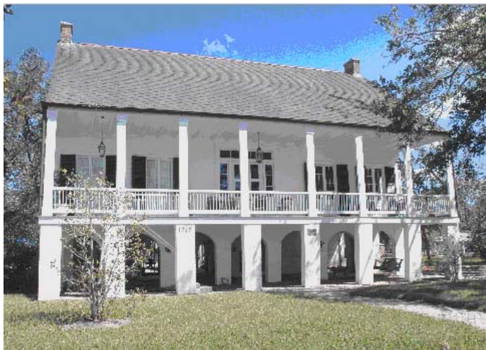
Elevation of a historic residence in Mandeville, Louisiana

While elevating a structure above the BFE will provide the structure the most protection, a less intrusive elevation may be desired or more feasible for a historic structure. Other protection measures, such as elevating utilities and equipment above the BFE, should be considered if elevating a historic structure to the BFE is not practicable.