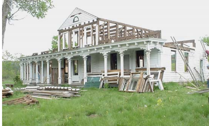
Dismantling of Bruchmann residence, May 2000

Relocation in Fulton, New York. On January 19, 1996, floodwaters of the Schoharie Creek rose nearly 18 feet damaging many properties in the Town of Fulton, in Schoharie County, New York. The Town of Fulton submitted a Hazard Mitigation Grant Program application to FEMA for the acquisition and demolition of 12 properties. In reviewing the Town of Fulton’s application, FEMA initiated consultation under section 106 of the National Historic Preservation Act. As a result, FEMA determined and the New York State Historic Preservation Officer concurred that one of the buildings in the application – known as the “Bruchmann residence” – was eligible for inclusion on the National Register of Historic Places and that its demolition would result in an “adverse effect.” The residence is significant as a notable and substantially intact example of a mid-19th century vernacular design and construction.