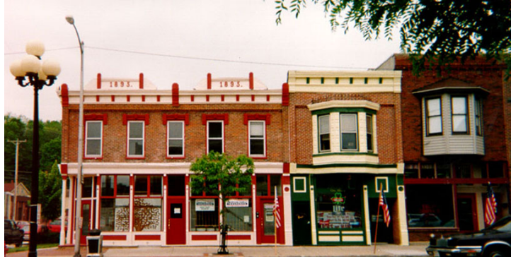
Restored and retrofitted buildings in Downtown Darlington, Wisconsin

Floodproofing in Wisconsin. Flooding is an ongoing part of life in the rural riverside town of Darlington, Wisconsin, having caused millions of dollars in property damage over the past decade. Following the devastating damage from the 1993 floods, the town could follow one of the three routes: do nothing and continue to suffer the periodic floods; move the central business district out of the floodplain and upset the local economy and sense of community; or do something innovative.