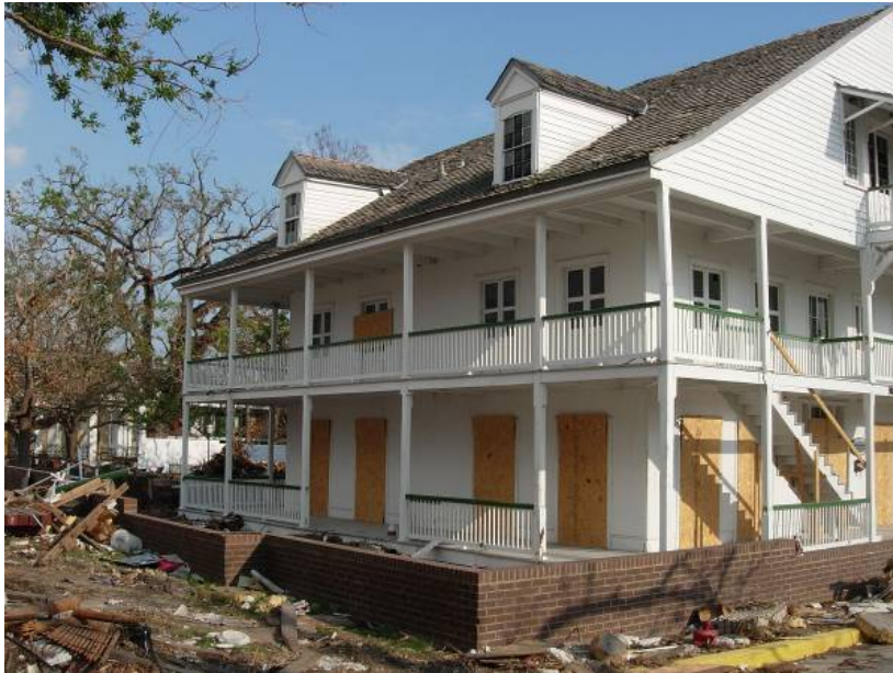
Built by John Holm in 1847, the Magnolia Hotel, badly damaged from Hurricane Camille in 1969, was moved 100 yards north and restored by the City of Biloxi in 1972. As a result, the hotel experienced only minimal flooding during Hurricane Katrina.

Relocation is the mitigation measure that can offer the greatest security from future flooding. Relocation involves moving the entire structure out of the floodplain or it may involve dismantling a structure and rebuilding it elsewhere. It may be possible to relocate a building to a higher part of the same parcel or lot, but often it will be necessary to move the building to another site. In either case, it is the most reliable of all mitigation measures. In addition to relieving the property owner from future anxiety about flooding, this method can offer the opportunity to significantly reduce or