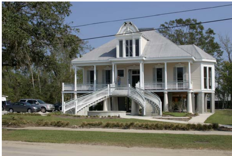
Elevation of a historic residence in Mandeville, Louisiana

Essentially, the steps required for elevating a building are largely the same in all cases. A cradle of steel beams is inserted under the structure; jacks are used to raise both the beams and structure to the desired height; a new elevated foundation for the house is constructed; and the structure is then lowered back onto the new foundation and reconnected. At a minimum, the foundation