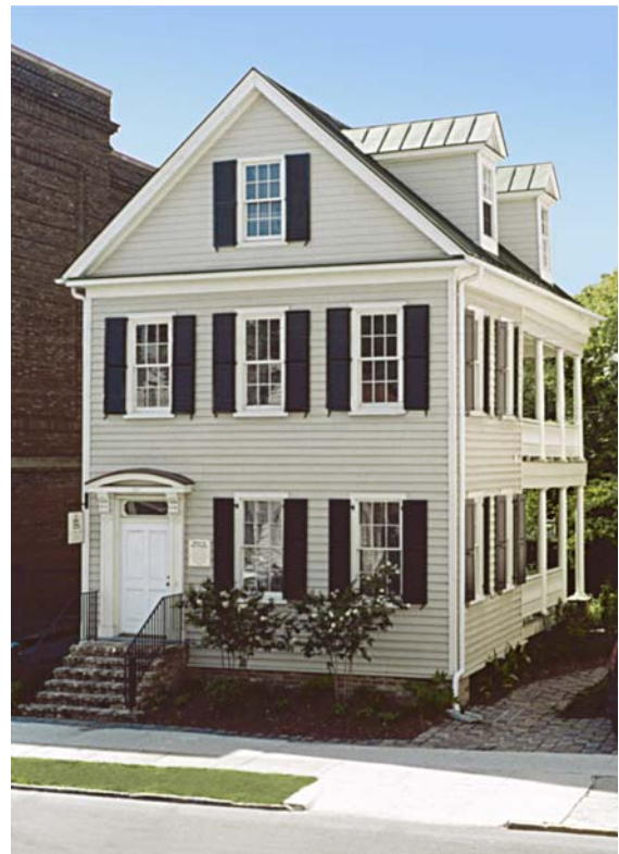
113 Calhoun today