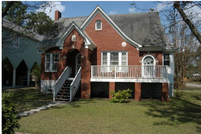
Frame building elevated on concrete block foundation faced with brick veneer. Belhaven, North Carolina.

With assistance from the North Carolina State Historic Preservation Officer, plans were developed for an elevation project that would best preserve the historic character of the district. In the plan, frame buildings were raised onto concrete block foundations faced with brick veneer. Brick buildings were elevated onto