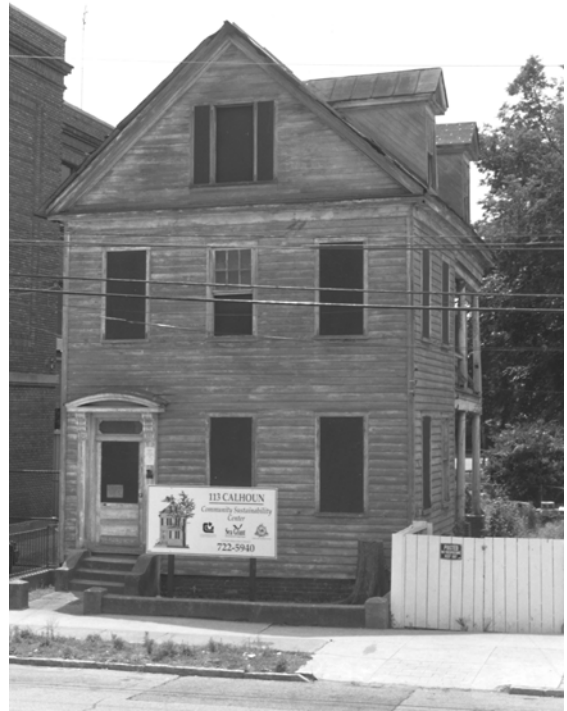
113 Calhoun at inception of project