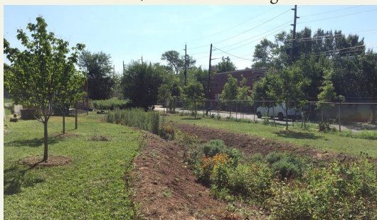
Camden Urban Promise Rain Garden

Treed communities have a reduced level of domestic violence and foster safer, more sociable neighborhood environments.