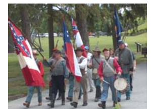
Civil War Re-enactors and Living History personnel marched from Fort Mott to Finns Point National Cemetery