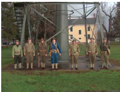
The Officers and Enlisted men of Battery E, 7th Coast Artillery.