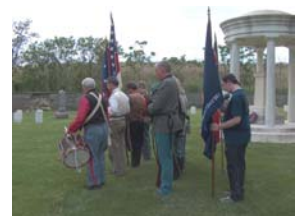
Small ceremonies were conducted to honor all the veterans resting in Finns Point National Cemetery.