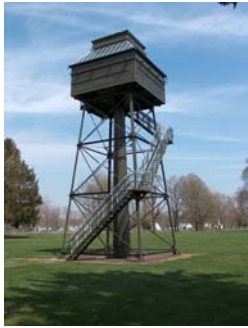
Eastern Fire Control Tower.