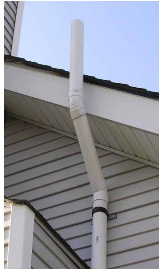
THE PIPE PICTURED ABOVE IS PART OF AN ASD SYSTEM.

reduces the amount of radon accumulating underneath a building's foundation. Pipes are inserted into holes drilled through the foundation floor. The pipes are connected to an exhaust fan, which vents radon outdoors, preventing it from entering the interior of the home. In addition, possible entry points for radon are sealed which include sump pits, openings around utility pipes, gaps between floors and walls, and large cracks in basement floors.