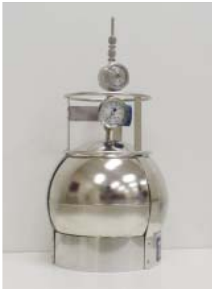
An evacuated air testing canister. The pressure inside the canister is initially set lower than the indoor air, which causes air to flow into the canister when the valve is opened.

It is not always easy to tell whether VOCs detected inside a building are due to vapor intrusion, background contamination or a combination of both. Before undergoing indoor air testing, you will receive a copy of NJDEP's Instructions for Occupants – Indoor Air Sampling Events . Following these instructions will help minimize background contamination and ensure the test results are as definitive as possible.