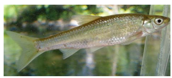
Eastern Silvery Minnow