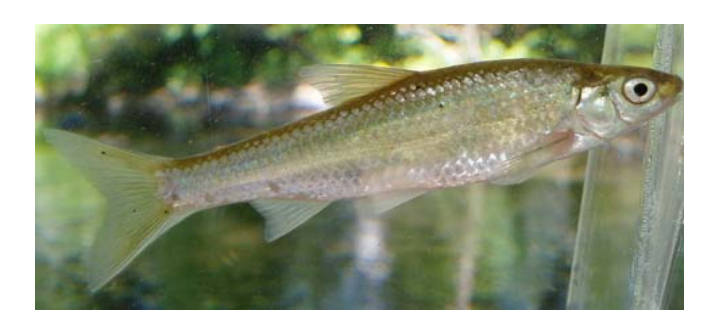
Eastern Silvery Minnow