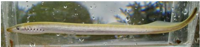
American Brook Lamprey