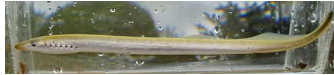
American Brook Lamprey