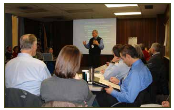
Dr. Tom Graziano (Chief, Hydrologic Services Division, NOAA/National Weather Service) speaking to attendees of the one-day IWRSS forum hosted by the DRBC in December 2012.

The eighth annual implementation progress report for the Water Resources Plan for the Delaware River Basin (Basin Plan) was released in September 2012. Compiled by DRBC staff, the report highlights the progress made in 2012 by agencies and organizations throughout the basin toward achieving the goals and objectives of the Basin Plan. The variety of programs and projects included in this report illustrate how the focused efforts of many agencies, organizations, citizen groups, and