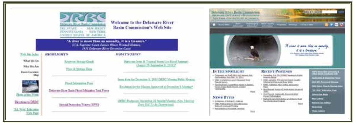
The commission's original web site (left) and new site unveiled in 2012 (right). The updated web site includes enhanced functionality, improved navigation, and additional outreach capabilities.

In her remarks, Collier said, "Rivers do not respect political boundaries. Therefore the best way to manage water resources is on the river's terms—using watershed