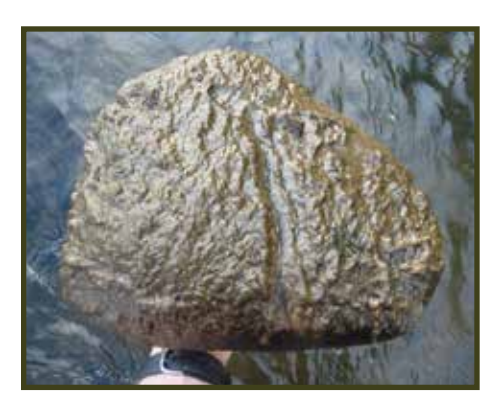
Didymo on a rock surface in Pike County near Matamoras, Pa.

Didymo covers rock surfaces in cold, moderate to fast flowing water. While Didymo is not a public health hazard, there is concern