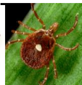
Lone star tick

These are common ticks in New Jersey that may spread disease to humans: