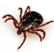
American dog tick