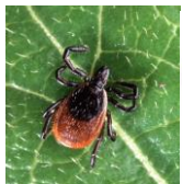
Black-legged "deer" tick