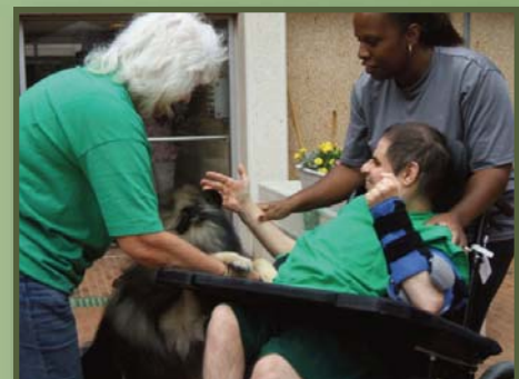
A consumer pets one of the pet therapy dogs.

The responses range from a smile to singing to throwing a kiss to the dogs. Many consumers can hardly wait for them to return!