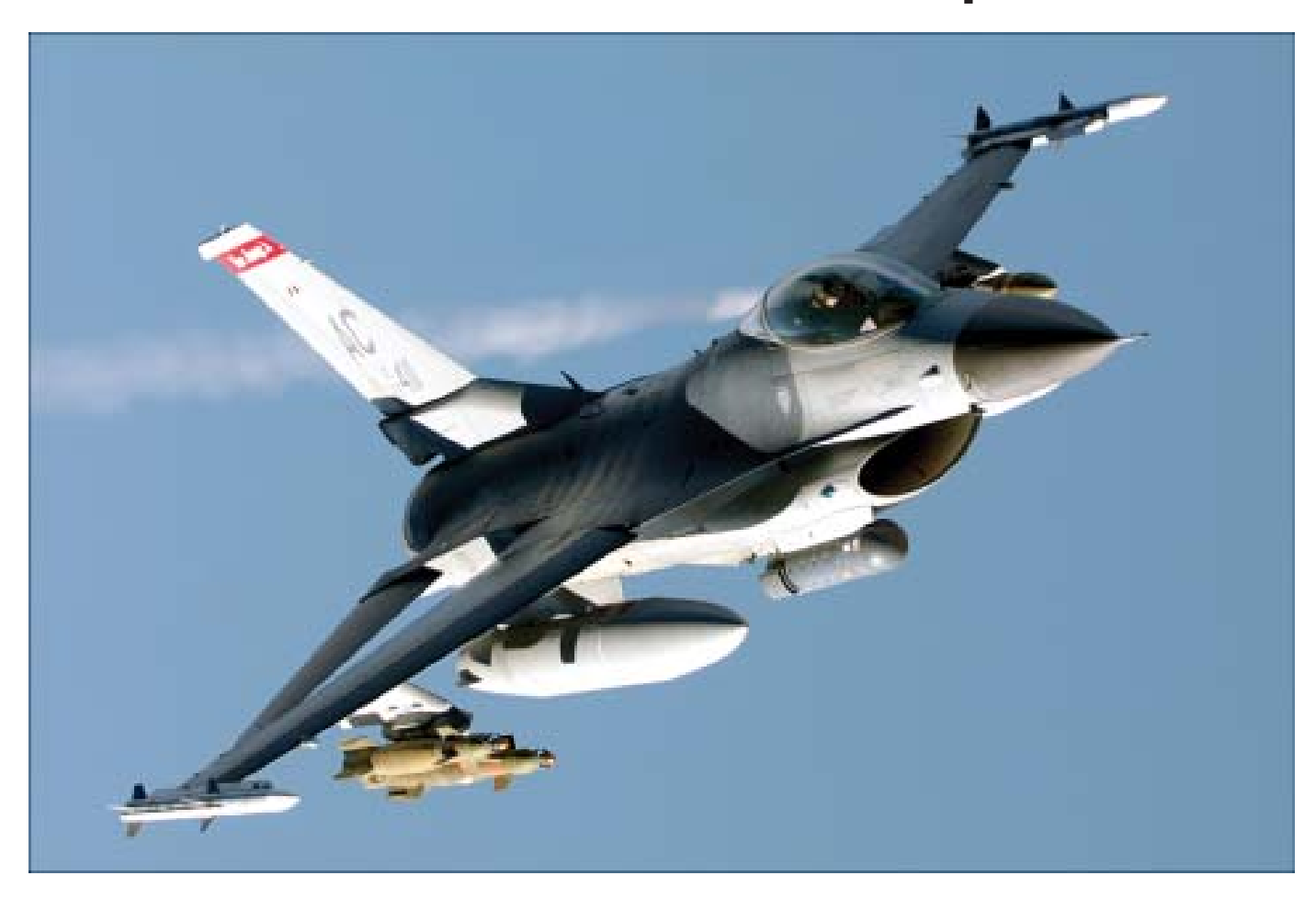
A 177th Fighter Wing F-16 prepares to refuel before carrying on with its' combat mission over Iraq July 23.

State of New Jersey Department of Military and Veterans Affairs PO Box 340 Trenton, New Jersey 08625-0340