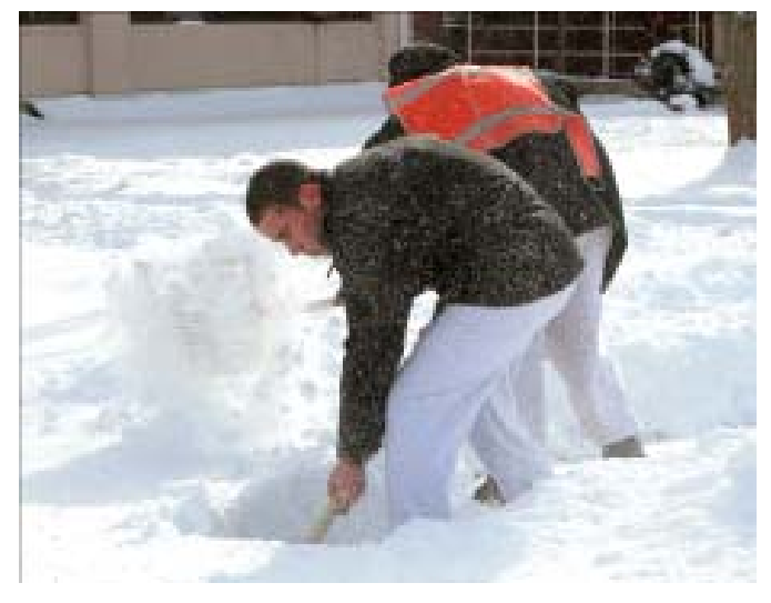
ChalleNGe cadets shovelling snow as part of their community service at Fort Dix.

The cadets learn the importance of community service by shovelling snow for families of deployed