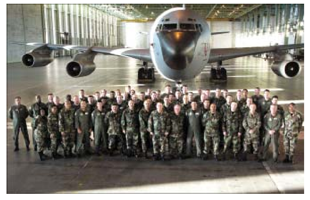
Members of the 108th Air Refueling Wing gather in a hangar at Istres Air Base for one last photo before the base closes its doors.