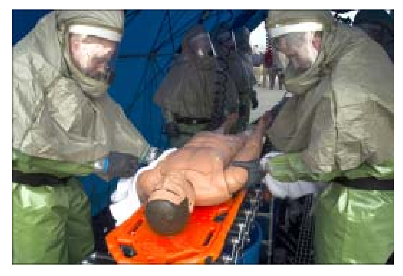
Members of the 177th Fighter Wing Medical Group demonstrate decontamination procedures for a non-ambulatory patient.

Victims who are unable to clean themselves are placed on a stretcher. The team removes the victim's clothing and places the patient and stretcher on a 16foot long track. As the victim is rolled down the track,