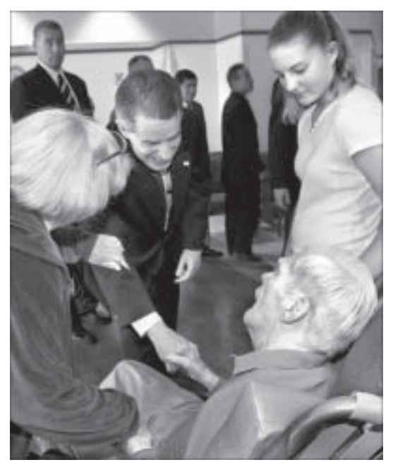
Governor James E. McGreevey greets a resident following the ceremony at the Old Glory Wing grand opening.

This unit will take special need residents into consideration and