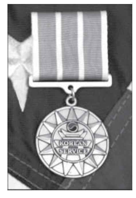
The New Jersey Korean Service Medal

Be sure to include full name, home address and daytime telephone number.