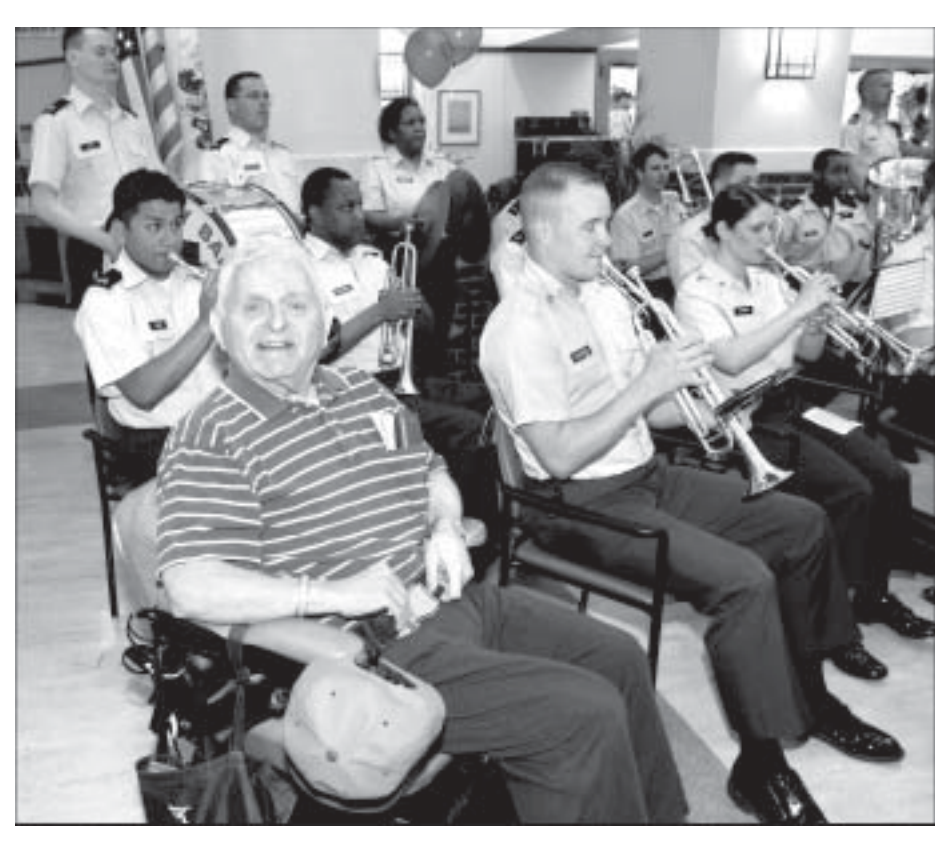
Both the 63rd Army Band and the residents enjoyed themselves at the Old Glory Wing Grand Opening at the New Jersey Veterans Memorial Home at Menlo Park.