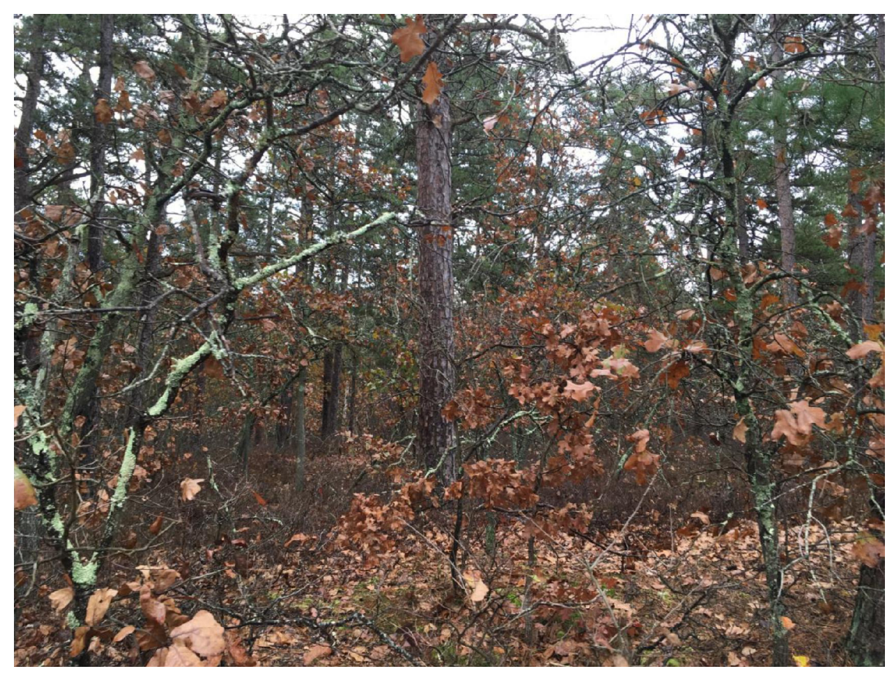
Fig. 2: Nearby non-thinned forest, Chatsworth