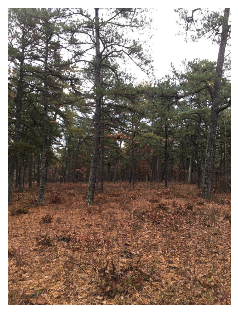
Fig. 1: Example of thinned area serving as fire break, Chatsworth