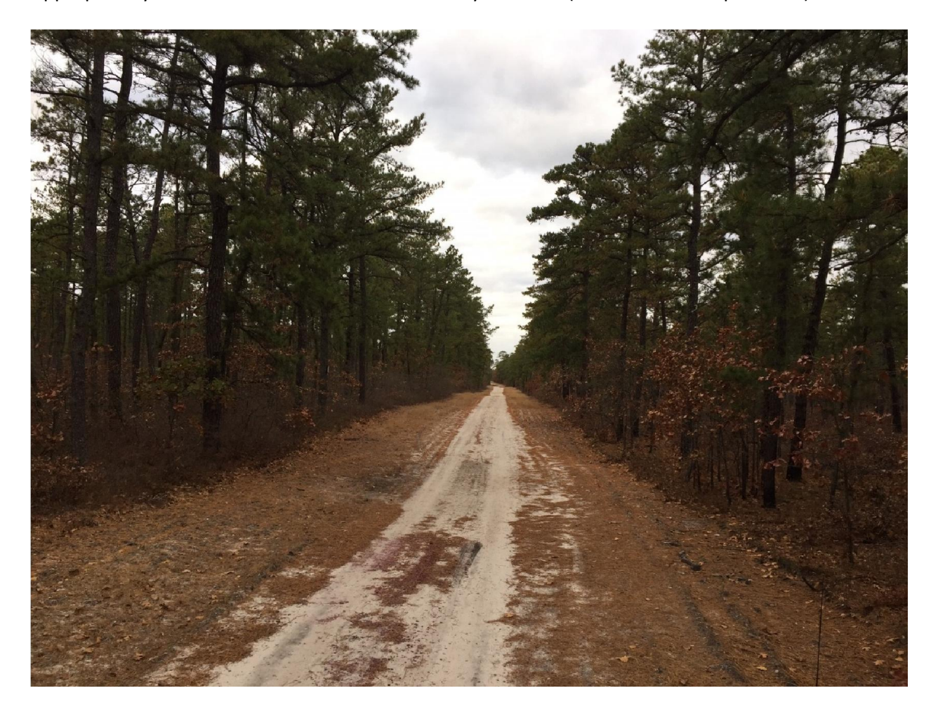
The CMP at 7:50-6.124 requires that the rights of way of all roads be maintained to provide an effective fire break in moderate fire hazard areas.