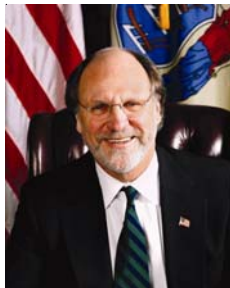
Jon S. Corzine Governor