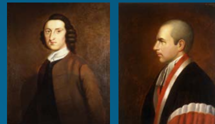
William Livingston and William Paterson (l-r)

New Jersey's five convention delegates were David Brearley, Jonathan Dayton, William Houston, William Livingston (the State's first governor), and William Paterson. Ultimately the convention decided to replace the Articles of Confederation with a new federal constitution creating three branches of government--legislative, executive, and judicial.