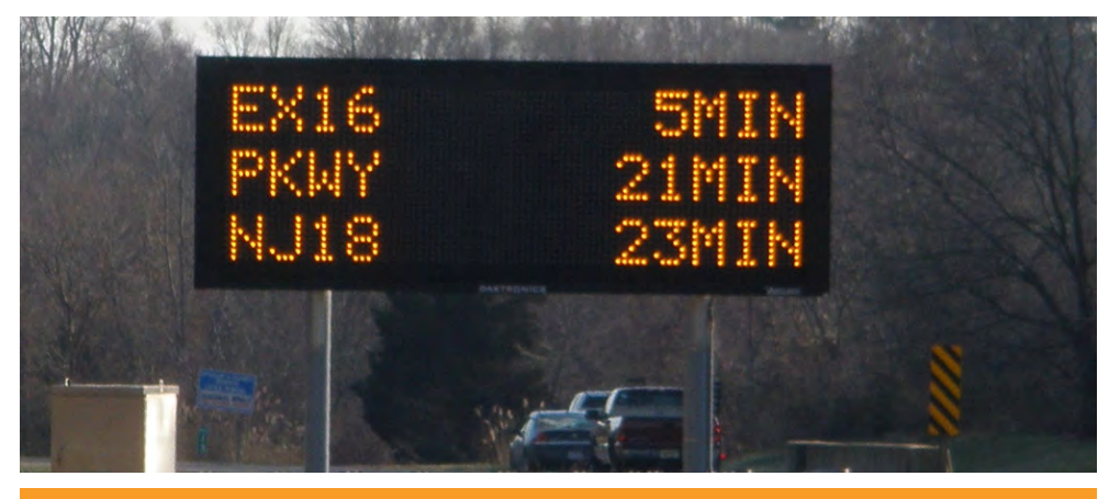
Real-time travel times

The 511NJ website will be the main source for travel information, travel times and advisories. The 511NJ phone service will also provide project and travel-related information for callers.