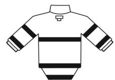
Back View Tail Trim Always 2" Width