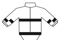
Front View (Split Trim Shown)