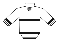
Back View Tail Trim Always 2" Width