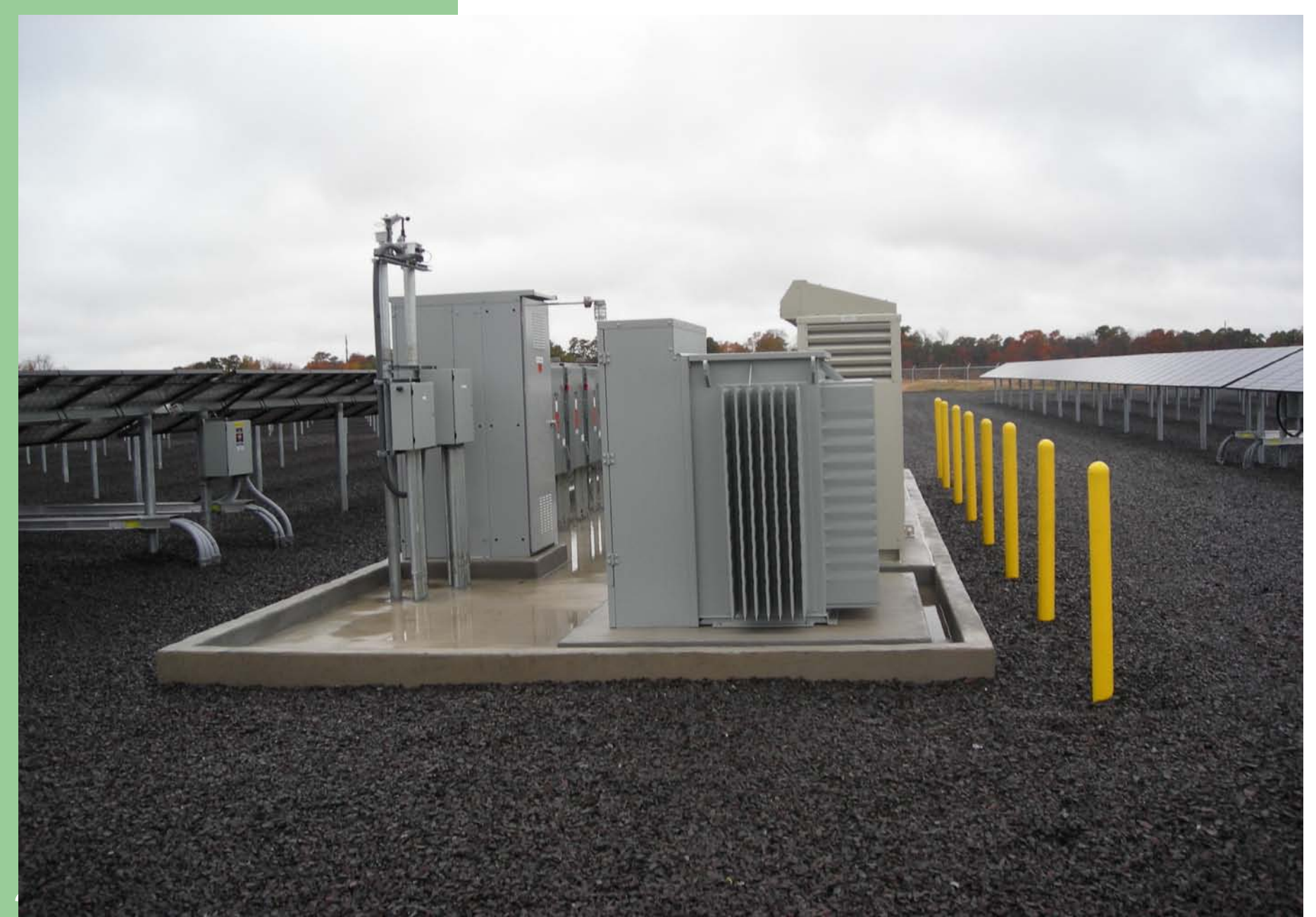
DIVISION OF TAXALION