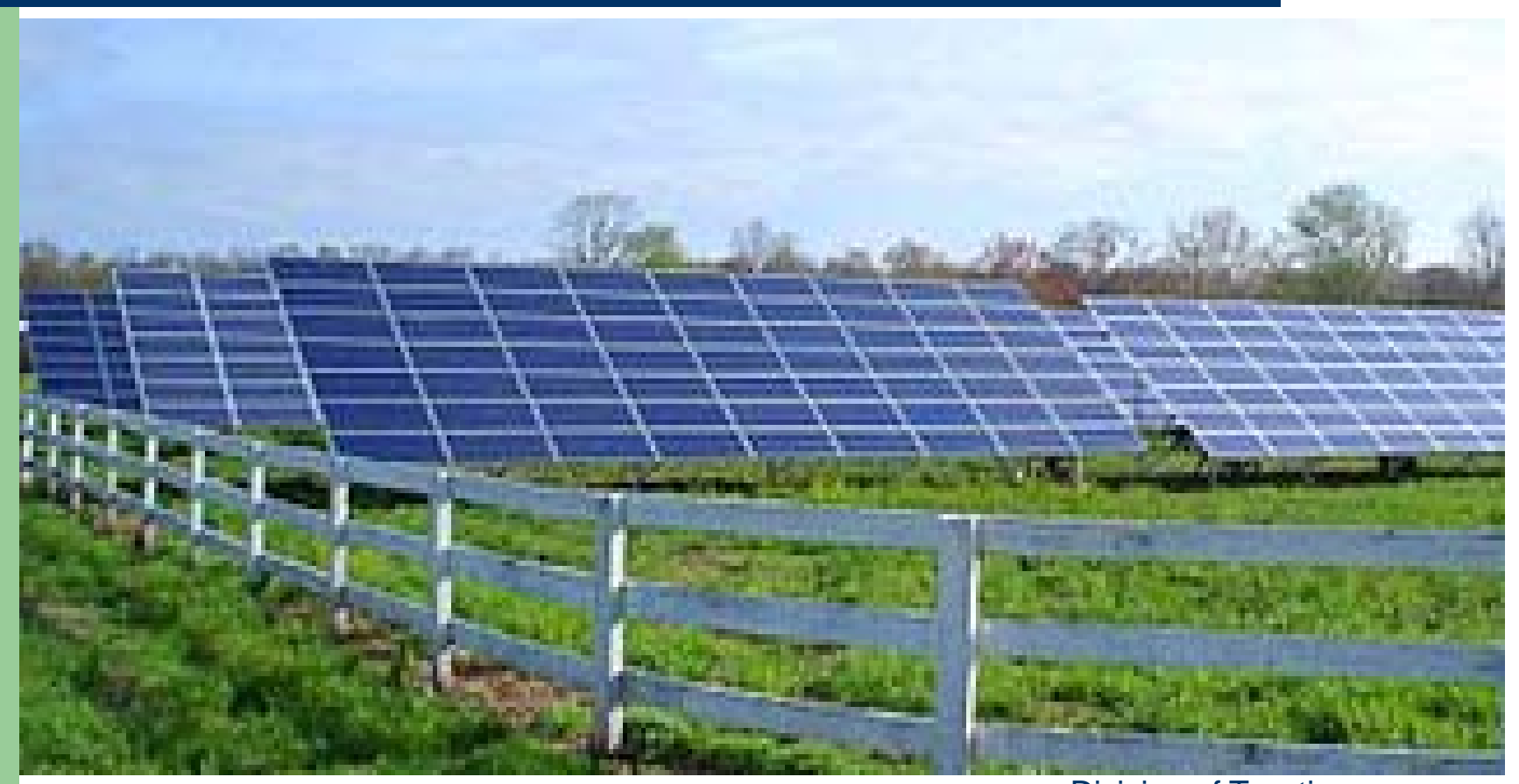
Division of Taxation