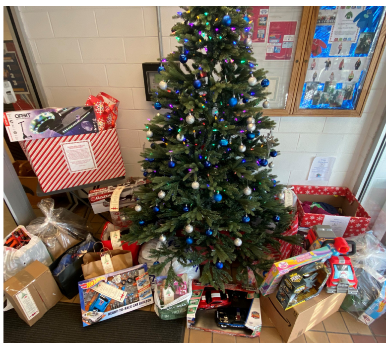
Toys were donated by staff for the holiday toy drive at Mid-State Correctional Facility.