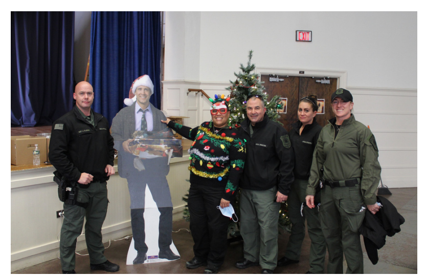
Members of the Special Operations Group (SOG) joined in on the holiday festivities at Central Office Headquarters.