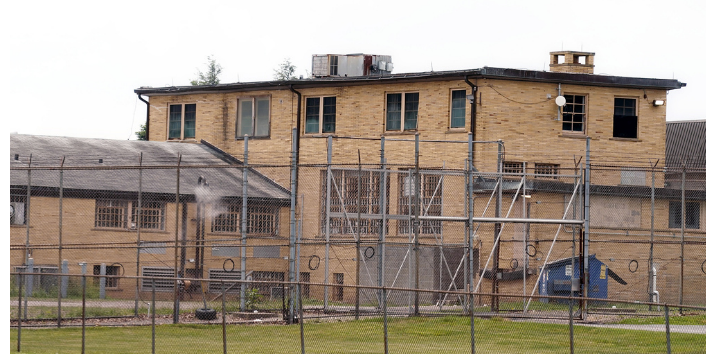
Edna Mahan Correctional Facility for Women located in Clinton N.J. will be relocated to a new facility.