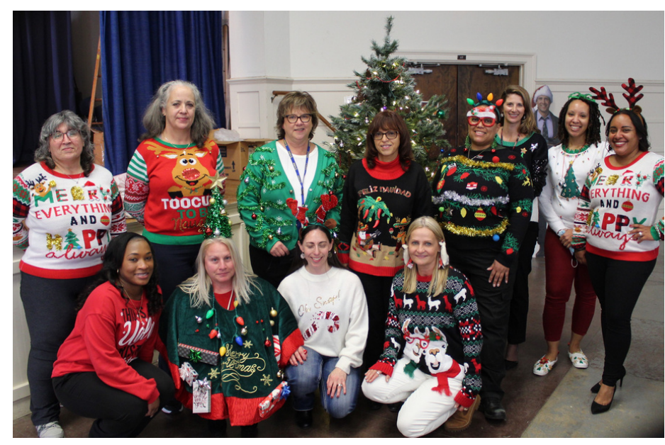
Staff at Central Office participated in the holiday sweater contest.