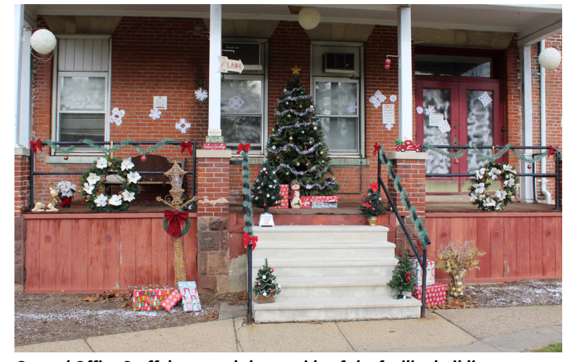
Central Office Staff decorated the outside of the facility buildings to spread holiday cheer.