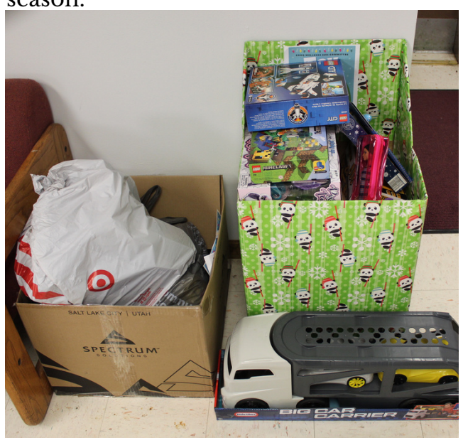
NJDOC Central Office Headquarters staff held a toy drive for children to receive gifts during the holiday season.