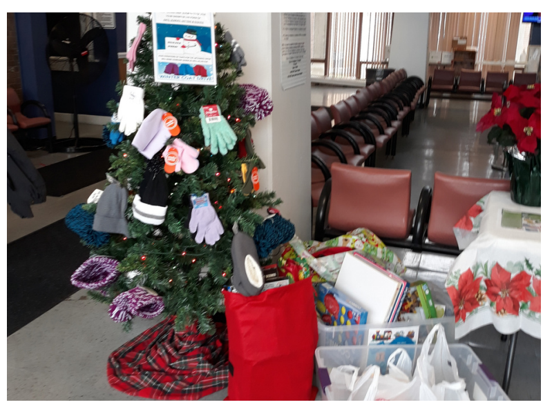
Staff at Bayside State Prison collected toys, hats, and gloves to donate.