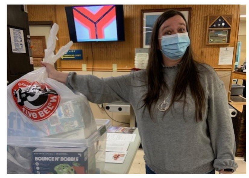
Southern State Correctional Facility Staff gathered toys donated by the employees to donate to a non-profit.