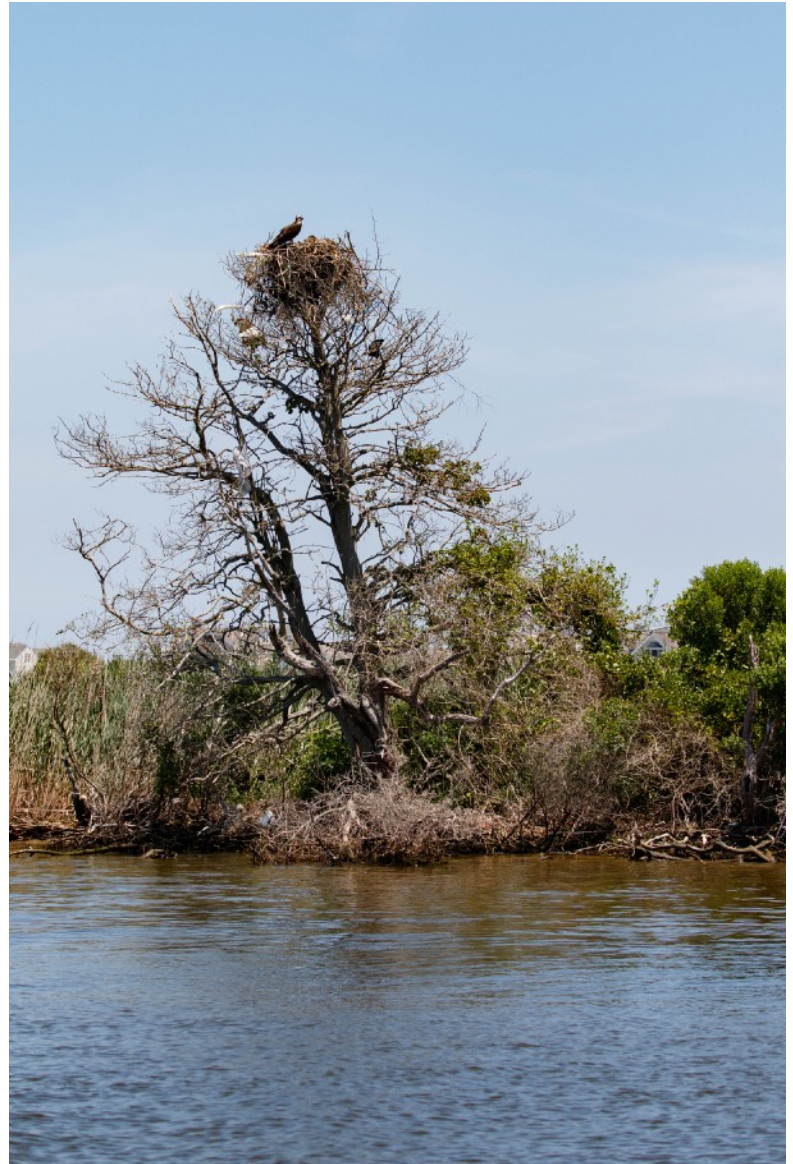
A new productive nest atop a dead red cedar tree on N. Barnegat Bay.

This year staff and volunteers recorded a total of 669 occupied nests — the most ever recorded in New Jersey. 542 of those nests were located along the Atlantic Coast and 97 along the Delaware Bay. 30 nests were active in the Northern region of New Jersey from the Meadowlands west to the Delaware River and south to the Betsy Ross Bridge. There were a total of 50 new nests reported or found in 2019. The average statewide productivity rate was 1.91 young/active (known outcome) nest which has increased slightly as compared to the previous four years. This is more than double the minimum needed to sustain the population.