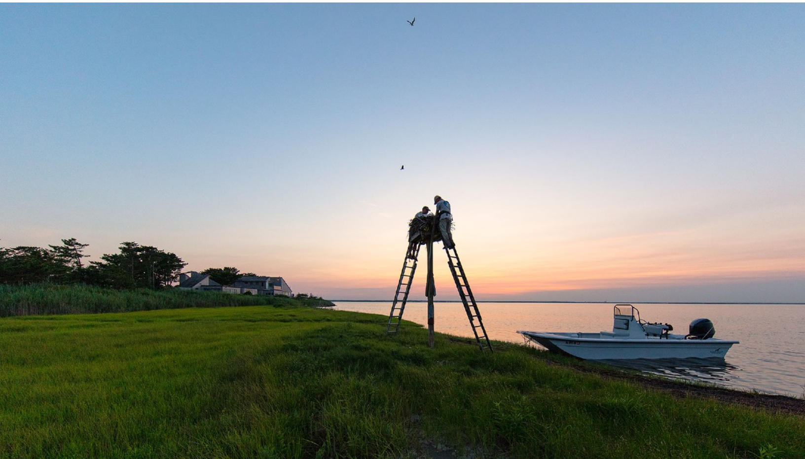
Our new 20' Maycraft skiff sits along the edge of the marsh at dusk in Loveladies. July 2019.