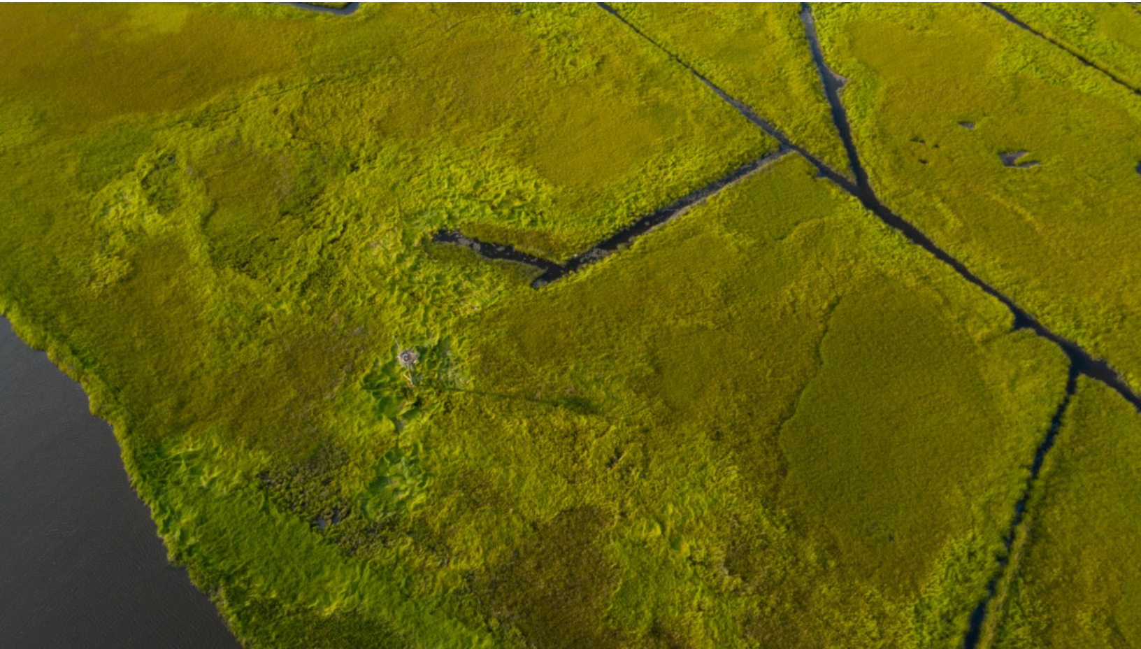
A sUAS (drone) approaches an active osprey nest inside Manahawkin Wildlife Management Area. July 2019.

remote nests by boat and Osprey Watchers — citizen scientists who report activity at nests online at: www.osprey-watch.org . Staff and Volunteer Osprey Banders use a ladder to climb up to nests, a mirror attached to a pole, or binoculars to determine the outcome of a nest. A portion of young are banded for future tracking with USGS aluminum bird bands. In recent years we have begun researching the use of sUAS or drones to determine the outcome in nests. Osprey Watchers use optics to determine activity and outcome at nests.