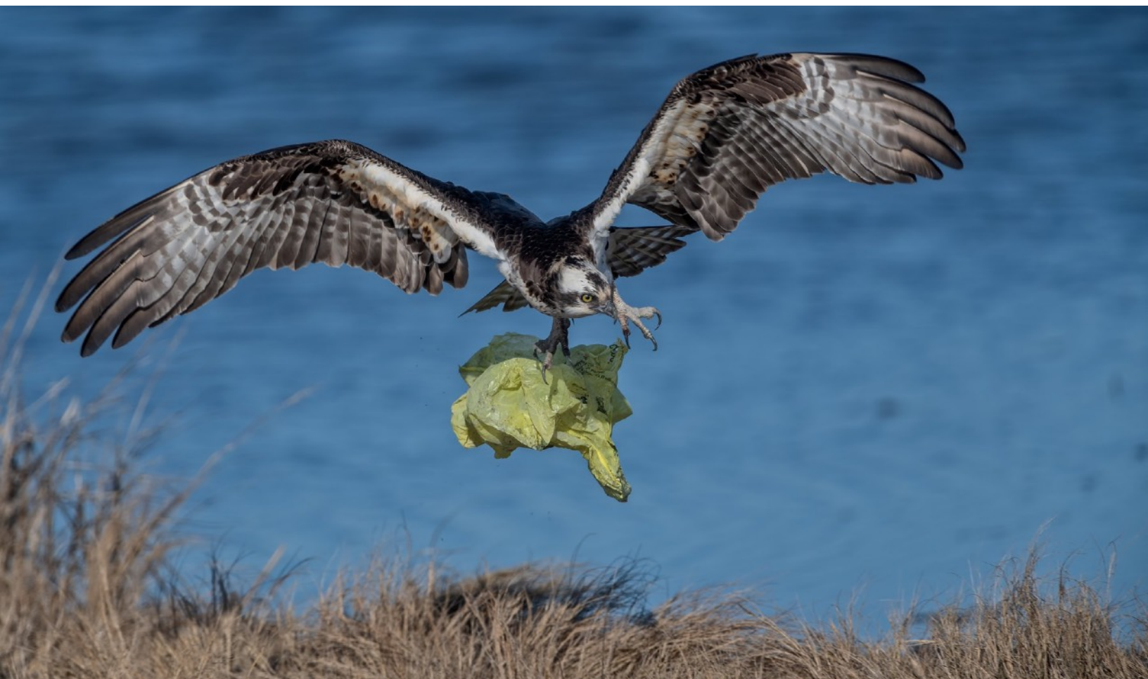
A male osprey picks up a single use plastic bag off the marsh in Oceanville, New Jersey. Spring 2019.

When analyzed, the contents can depict their exposure to pollutants in the environment that are biomagnified through the food chain like DDT/DDE, PCBs, flame retardants and heavy metals. Past studies have shown that levels of organic contaminants in the environment have declined, but levels of heavy metals have increased. Ospreys have not shown any indications that contaminants are at levels which would affect their reproduction.