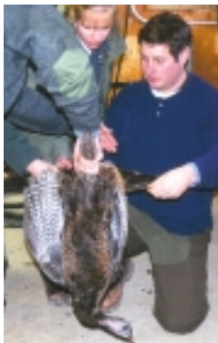
Collecting biological information from a hen which will be released in Ocean County.

turkey males are captured with cannon nets, fitted with radio transmitters, banded, weighed and measured, and released on site to be tracked for up to five years. The radios transmit a special signal (mortality signal) when the bird remains motionless for four hours or more, and the cause of death can usually be determined from visual clues at the scene. Yearly mortality of wild turkeys can be as high as 50% from all causes combined, and hunting mortality should generally not be more than 25%. In the spring of 2000, 3 of 51 marked turkeys were harvested by hunters while 11 of 50 were harvested in 2001. The most significant cause of mortality for turkeys has been predation by coyotes, great horned owls, and red-tailed hawks. Hunting mortality has remained within acceptable limits. If a dead turkey with a transmitter or a leg band is found, please leave the scene intact and call (908)735-8793. Sportsmen and women who harvest a gobbler with a radio or leg band should call immediately after checking the turkey, and will receive a document from the Division which will include information about that particular bird.