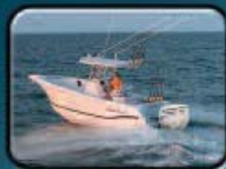
28 Grand Sport