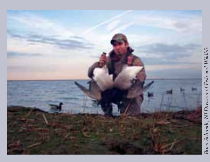
The US Fish and Wildlife Service has the final decision for setting annual migratory bird regulation frameworks. States participate in that process through the Flyway Council System.

arly in the 20th century, conservationists witnessed the plight of North America's rich migratory bird resource due to overexploitation. Since these birds' breeding and wintering areas spanned from Canada through South America, these visionary men recognized that the only way to cease this devastation was through a holistic management approach where migratory birds were recognized as an international resource. Through the hard work of these conservationists, the Migratory Bird Treaty Act (MBTA) was passed in 1918. The MBTA bestowed ultimate management authority with the federal government of each country. Until that time, individual states