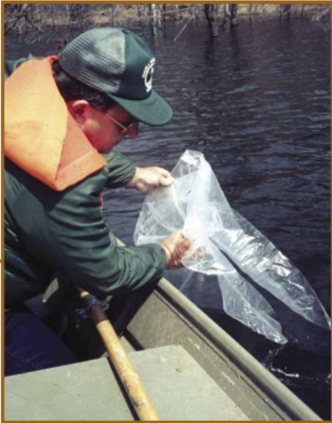
NJ Div. of Fish and Wildlife