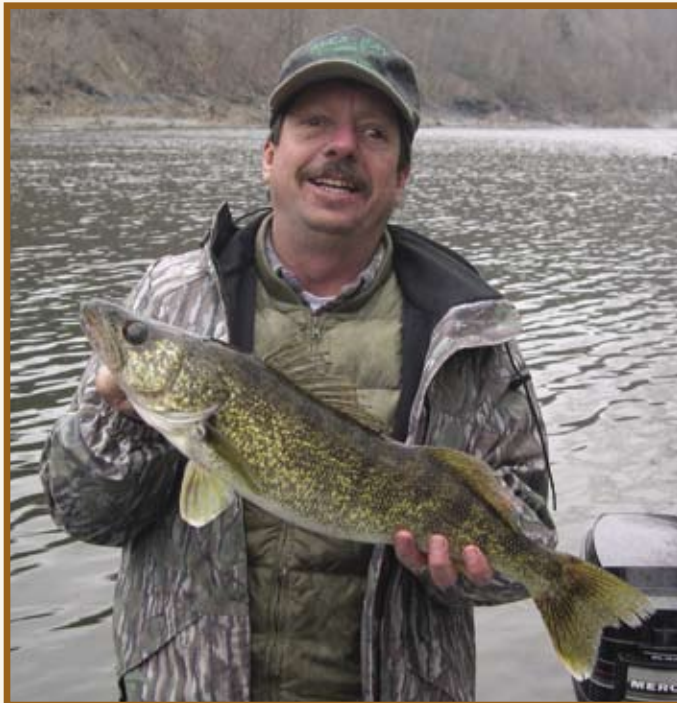
NJ Div. of Fish and Wildlife

A new intensive culture facility at Hackettstown boosts the warmwater team's productivity.