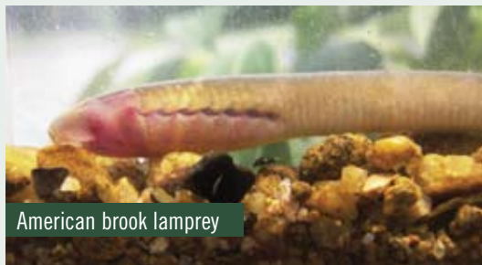
American brook lamprey

One of New Jersey's most interesting species is the American brook lamprey . They spend the first four to five years of their life blind, buried into the substrate, filter-feeding upon small particles. During the last year-and-a-half of their lives, functional eyes develop and their hood-like mouth transforms into a toothed, disk-like structure, similar to their relative the sea lamprey. However brook lampreys are not parasitic; they neither eat nor have a functioning digestive system in this adult stage, where they reach a maximum length of just over 12 inches. Because they require specific water conditions with a silt-free substrate, the American brook lamprey also serves as an indicator species, acting as a marker for this particular habitat feature.