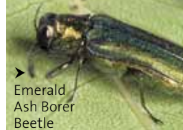
► Emerald Ash Borer Beetle